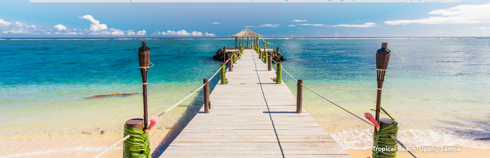
Tropical Beach, Upolu, Samoa

For more common phrases and translations, refer to: https://omniglot.com/language/phrases/samoan.php