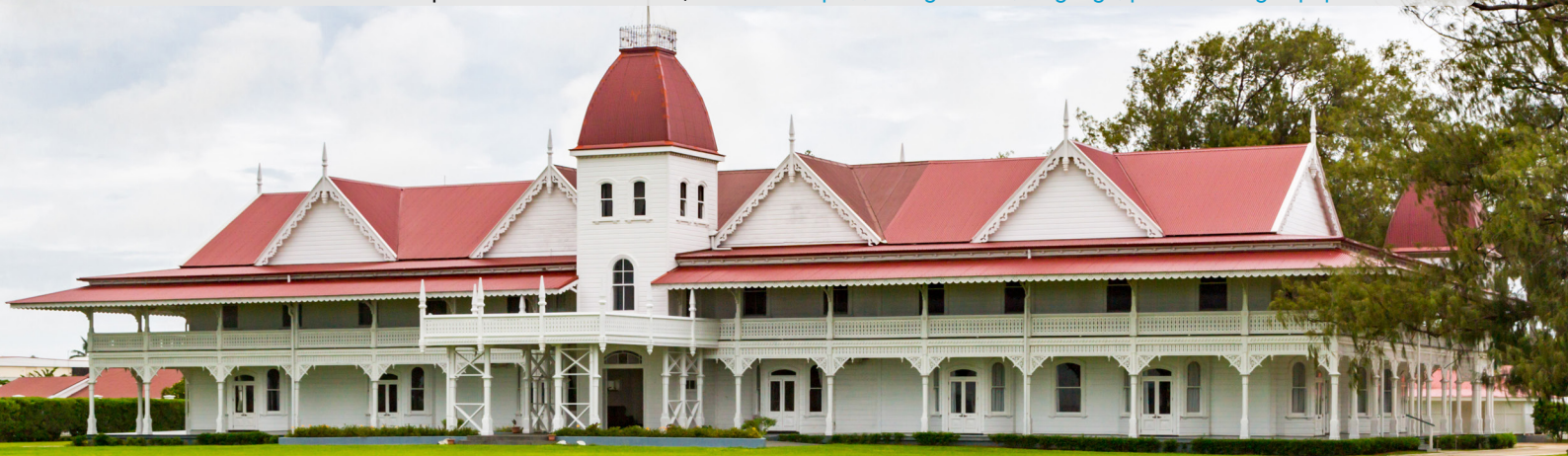
The wooden Royal Palace of the Kingdom of Tonga in the capital of Nukualofa

For more common phrases and translations, refer to: https://omniglot.com/language/phrases/tongan.php