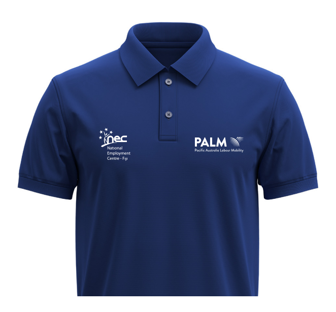
Polo shirt example

► Sample products with / without the PALM scheme / Australian Aid identifier and with ministry logos.