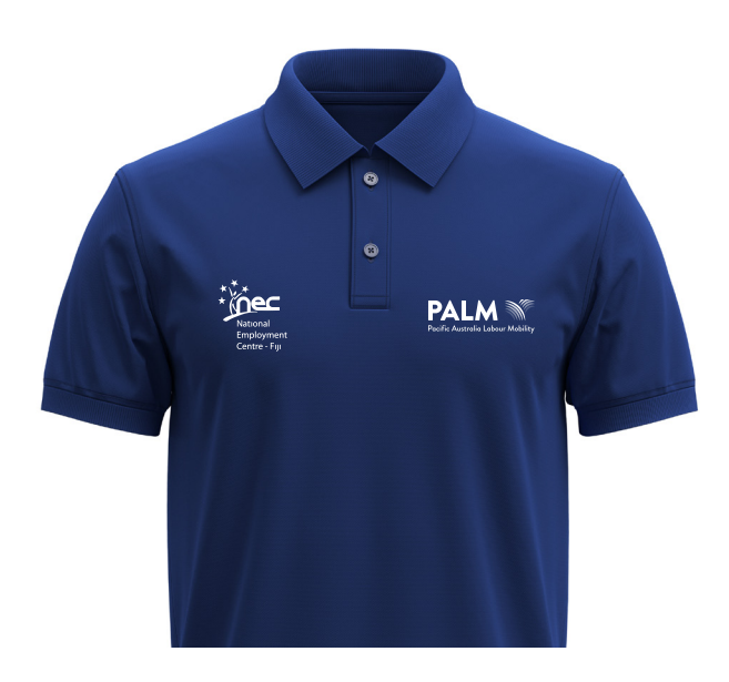
Polo shirt example

► Sample products with / without the PALM scheme / Australian Aid identifier and with ministry logos.