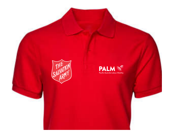
Polo shirt example

▶ Sample products with official partner branding.